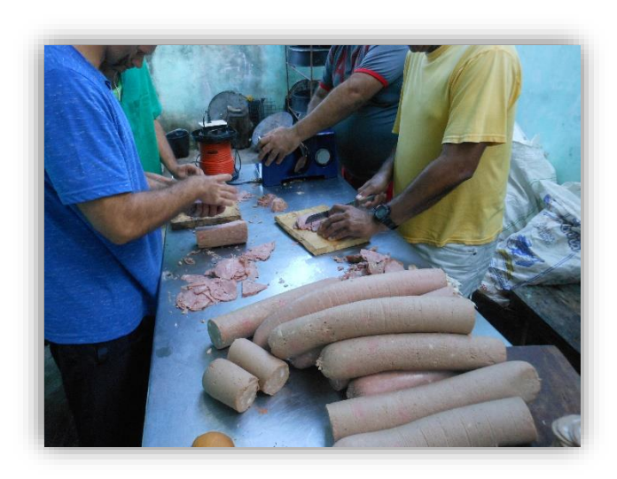
We will prepare daily meals for the needy and especially the elderly. Our goal is to open feeding 50 people per day